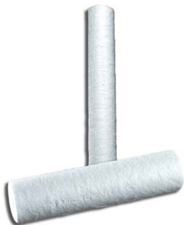
Figure 1: Purtrex Depth Cartridge Filters